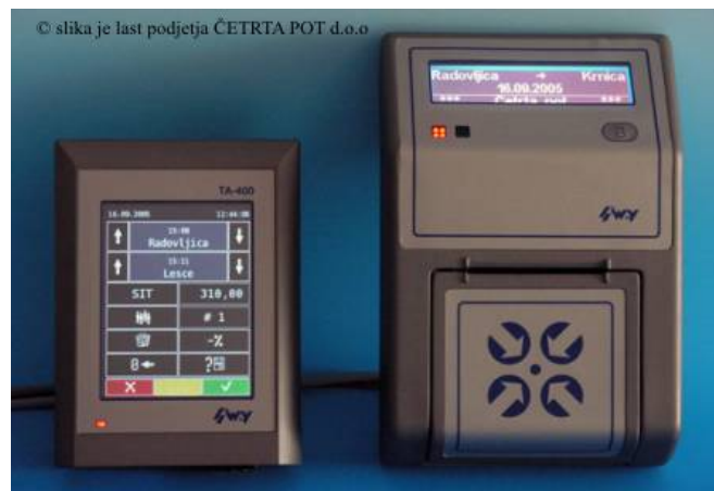
Figure 1: None-cash fare payment system