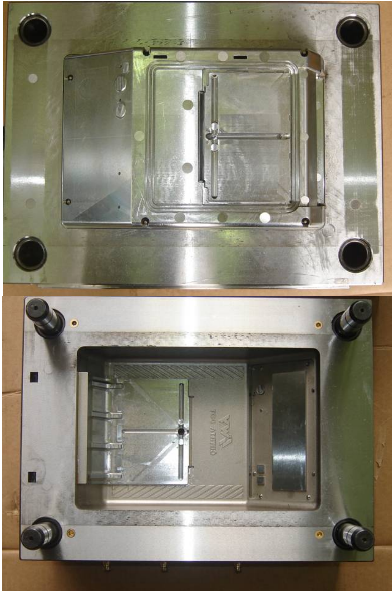
Figure 5: Final production tools

This project has clearly shown the advantages of using rapid prototyping technologies in early stages of new product development. The final estimate was made that shows 80% in lead-time reduction in comparison to conventional methods. All partners who participated in this project are members of RAPIMAN - Rapid Prototyping and Innovative Manufacturing Network.