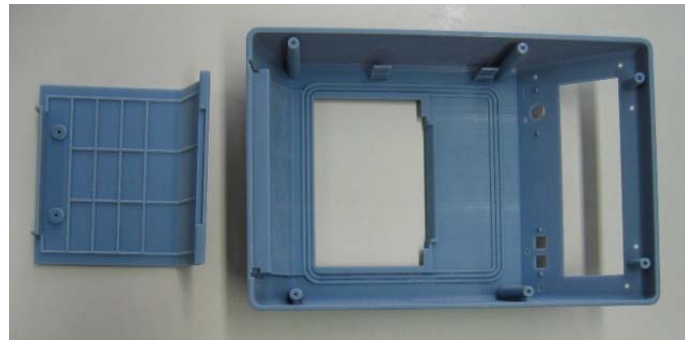
Figure 3: PolyJet™ prototype

The next step was the production of the physical prototype (Figure 3) by PolyJet™ rapid prototyping technology at Rapid Prototyping laboratory in the Faculty of Mechanical Engineering in Maribor. The PolyJet™ prototype was used for test-assembly of electronic components and testing of user control layout.