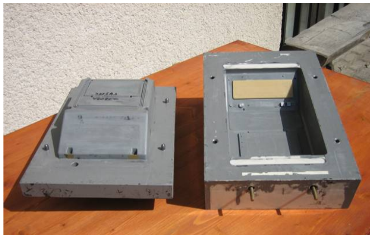
Figure 4: ET Rapid tooling moulds

The PolyJet™ prototypes were also used as patterns for manufacturing epoxy resin tools (ET Rapid Tooling) that were later used to produce a batch of 100 housings by RIM (Reaction Injection Molding) procedure. ET moulds and the first batch were produced by Modelarstvo Stanovnik ltd. (Figure 4).